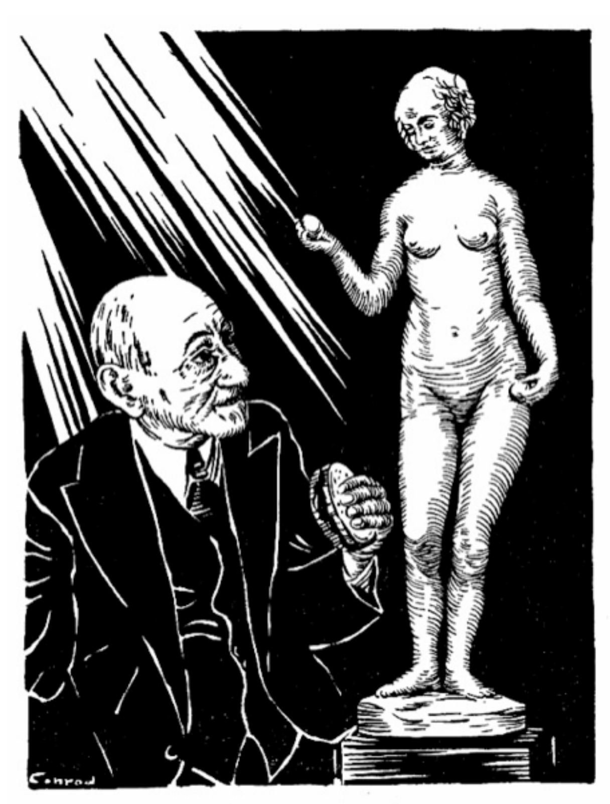
The Jew is Amused