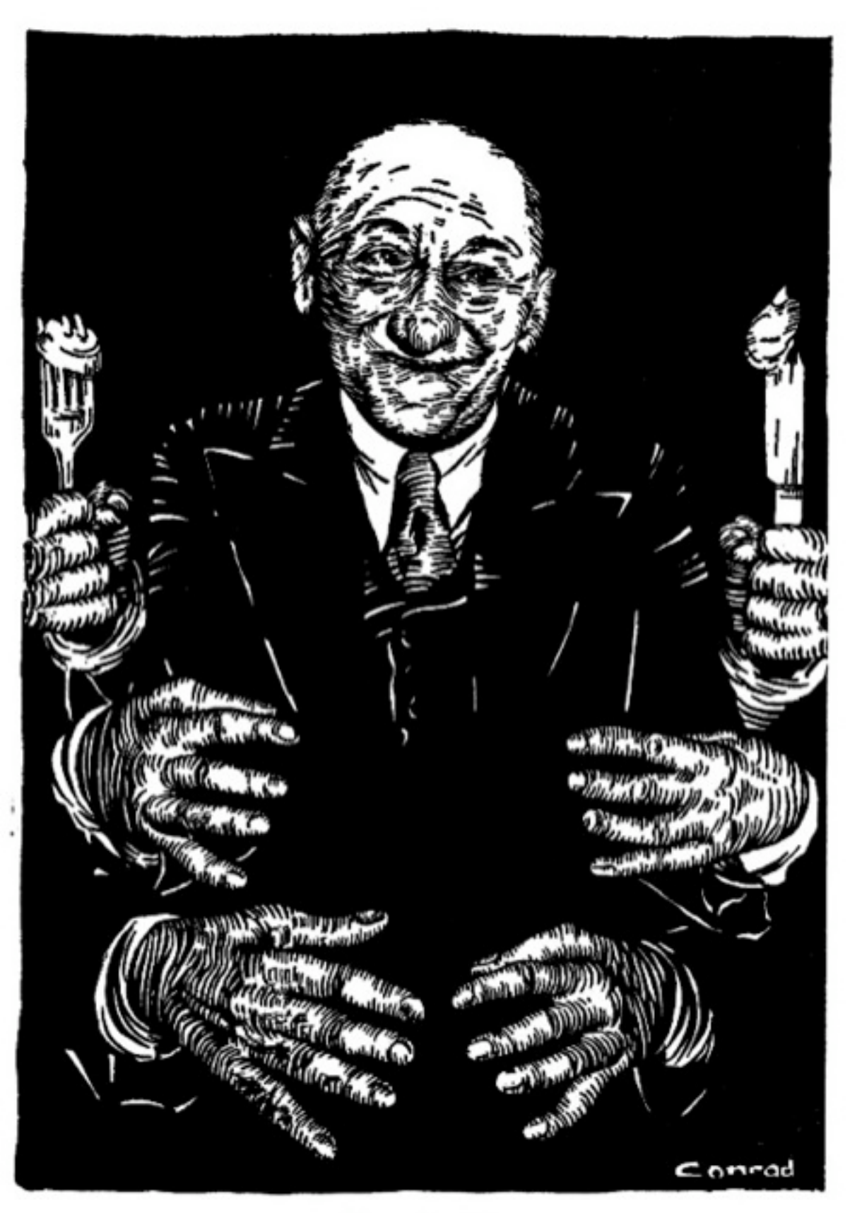
"I must eat."