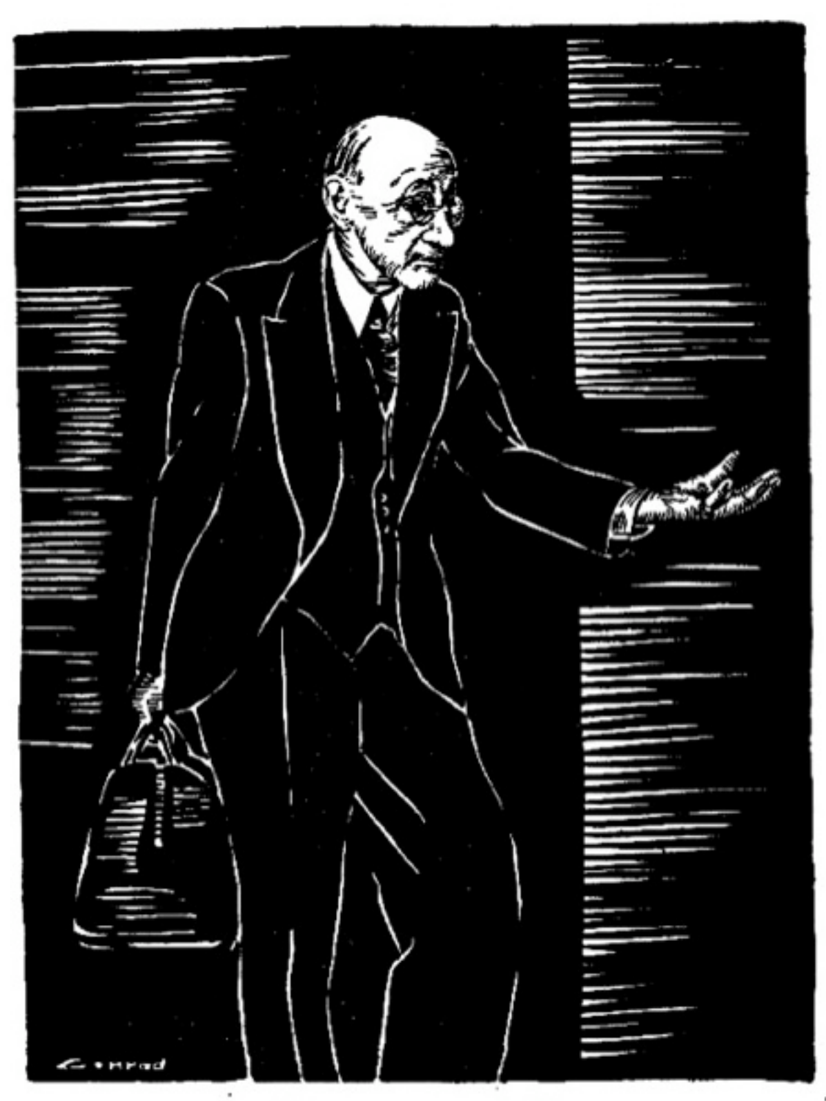
"I get my money first."