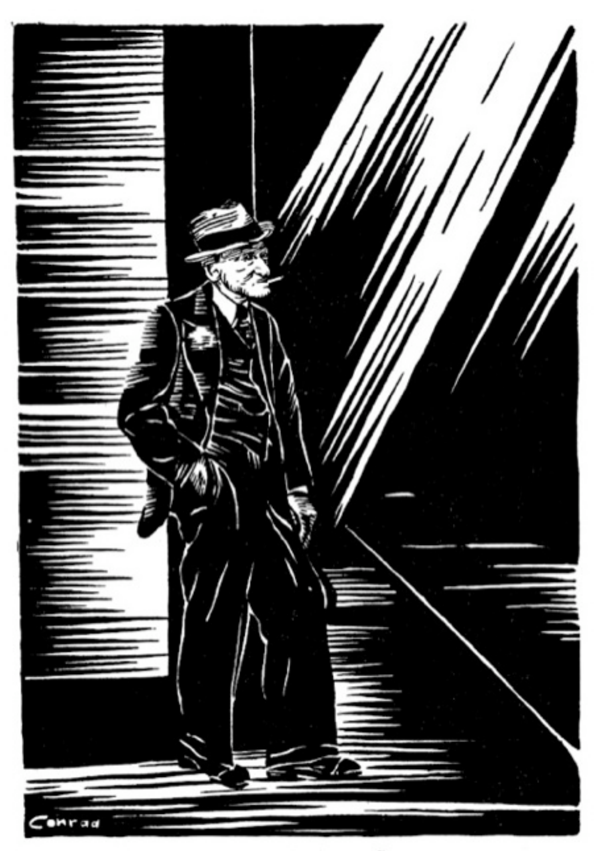
Decorating the Street Corner