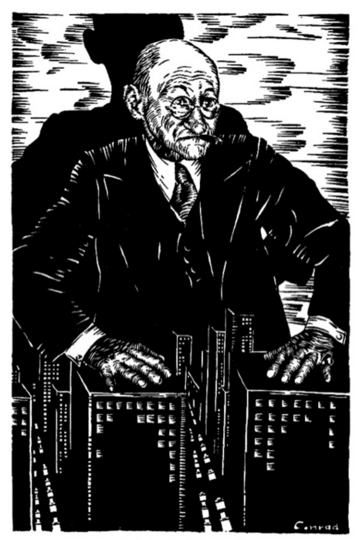
The Jew and the Land