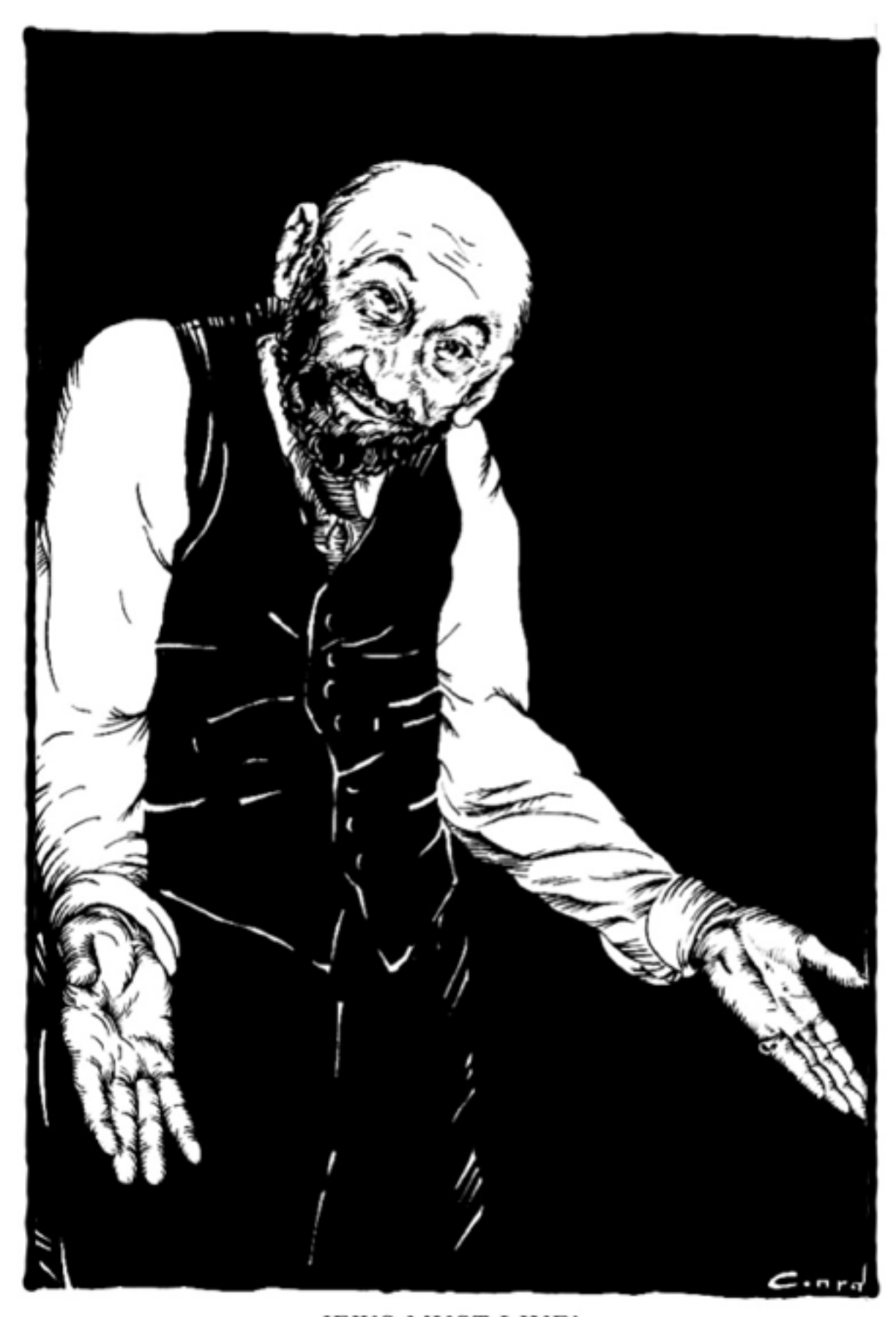
JEWS MUST LIVE!