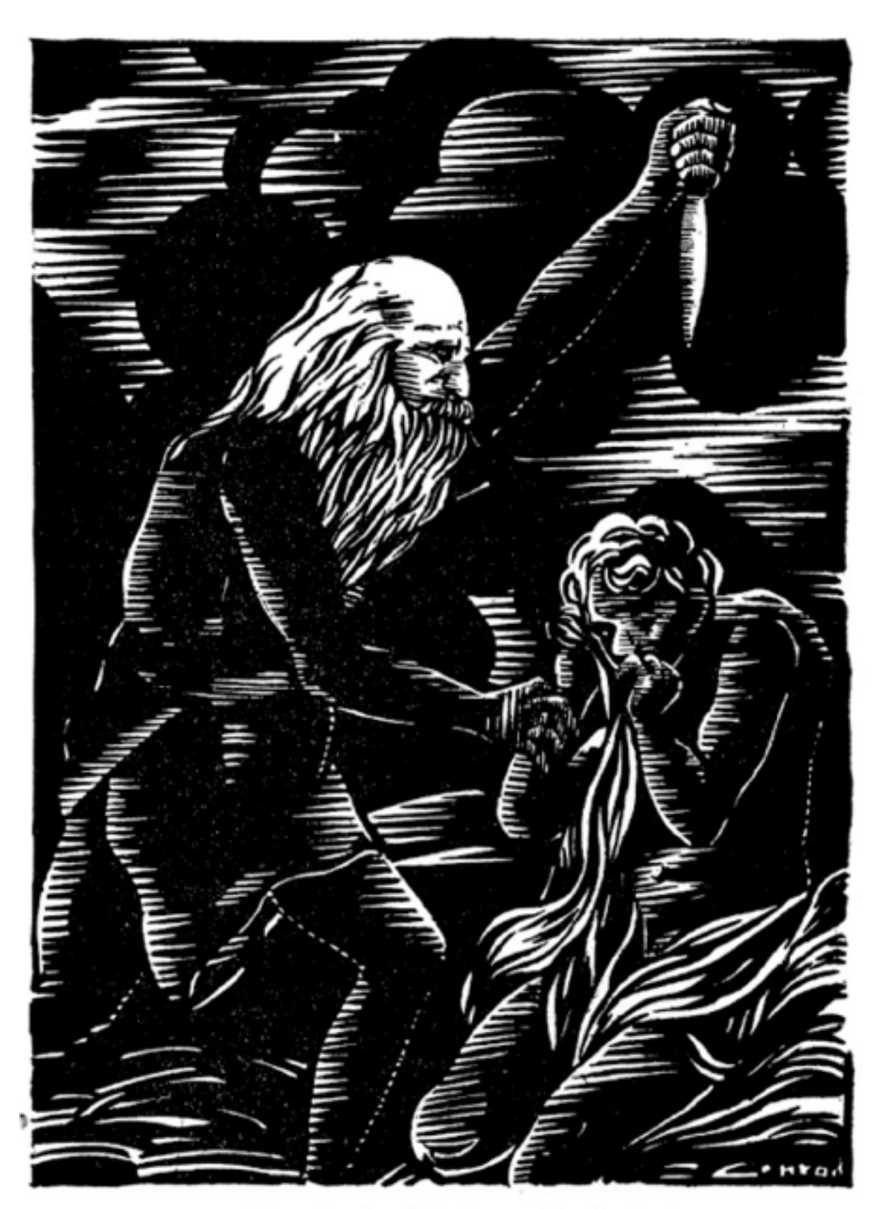
Pursuit of a Murderous Instinct