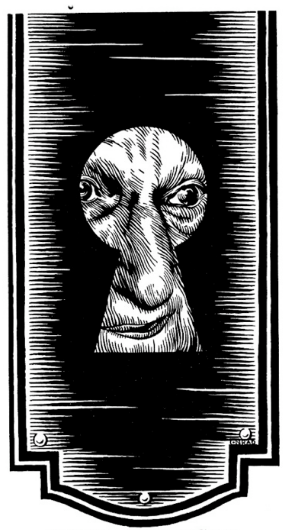
The Jew's Contribution to American Literature