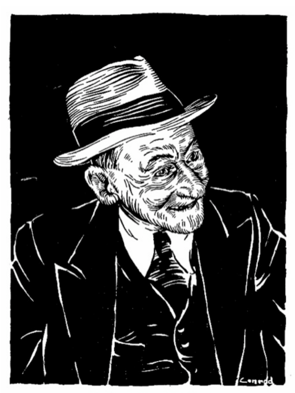
The Shadow Over Main Street